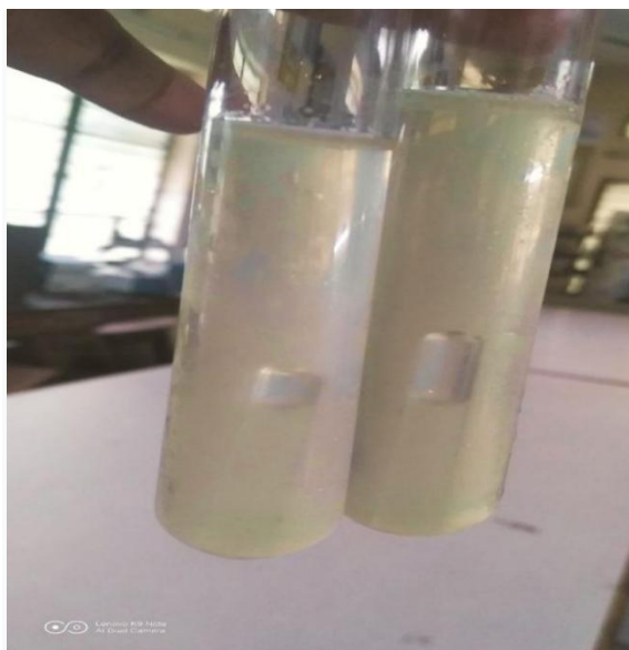
Gas production by E.coli in bore well water sample

In RO water, there is no growth thus no turbidity, no gas production and even no colour seen.