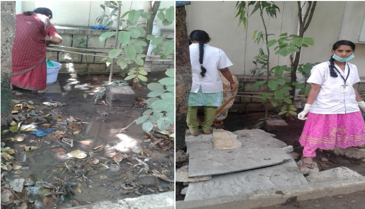
Near the entrance where drinking water is collected- before and after cleaning.