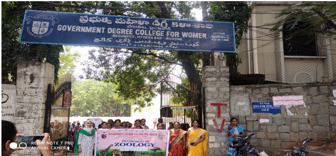
At Government High School, Begumpet the students were given demonstrative lectures to create awareness about diseases caused by Mosquitoes and importance of cleanliness