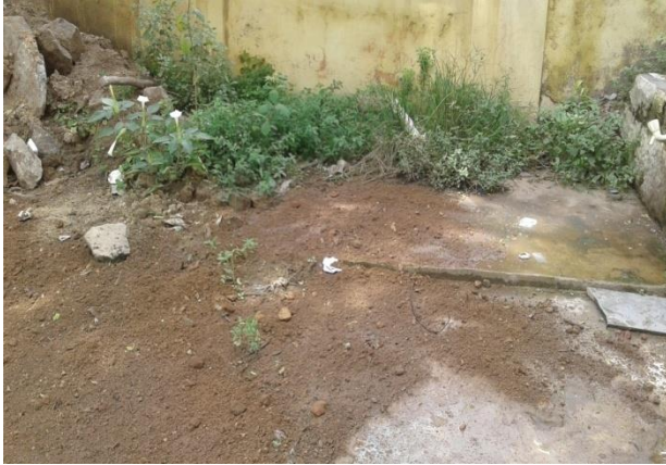
Near the water tank of Ambedkar open university- before and after cleaning.