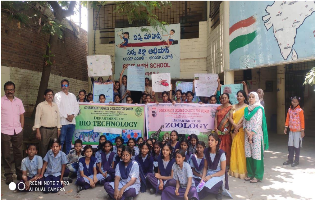
Distribution of Herbal Mosquito repellents to the students of Government High School, Begumpet.