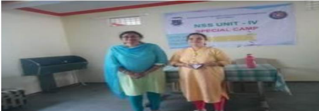
Free Medical Camp organized in collaboration with Lions club, Hyderabad