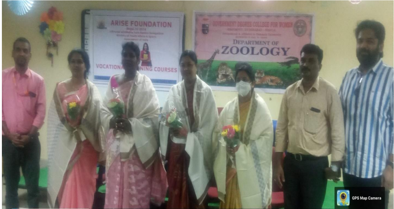
Felicitation to the Faculty