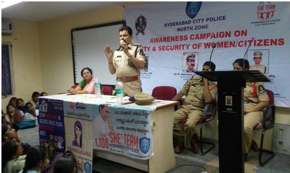
SHE Team Programme in the College

The majority of rapes occur in the victim's home. According to the Bureau of Justice, almost 40 percent of all rapes take place in the female victim's home. In the event that rape prevention fails—such as by avoiding problem areas or making sure a woman is never alone—the best chance for survival is to fight back. Fighting back is not just necessary, but it is a moral right because protecting one's self is paramount. The rest of the article will discuss why self-defense is important, some tools and techniques for effective self-defense, and information on gun use.