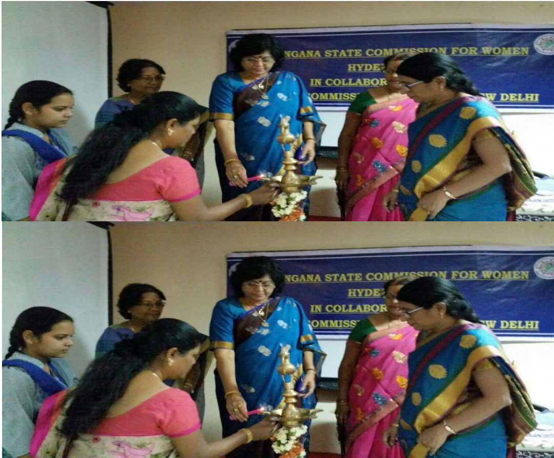
Inauguration of the Programme by Principal and Chief Guest