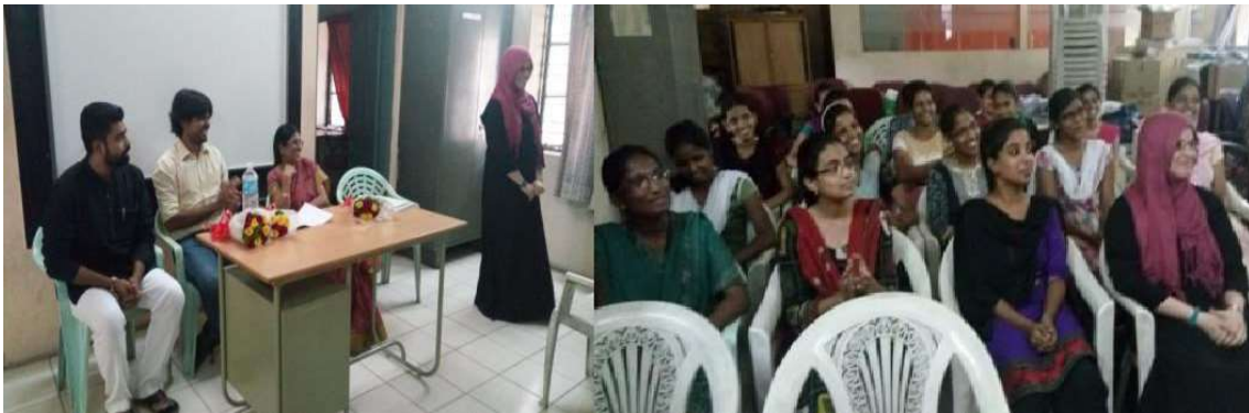
Inauguration of YuvaJagruthi