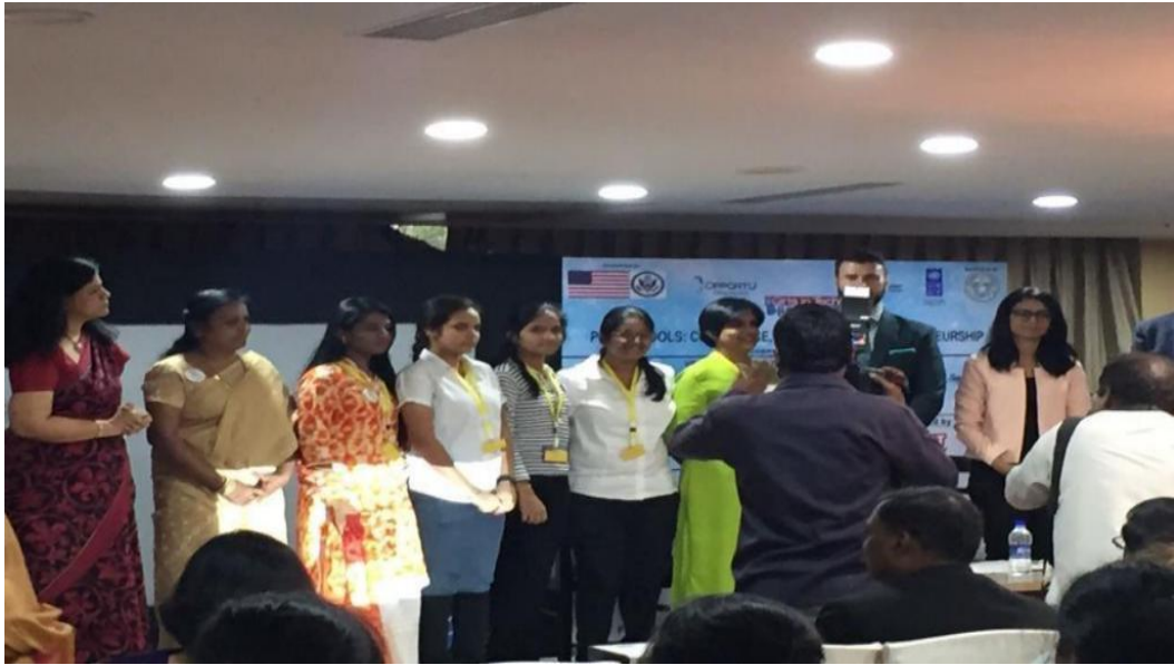
Students Participating in the workshop

An Interactive Session was Organised by YI YUVA –CII On Mythology and Its Relevance In Today's Business World. Resource Person was Dr. Dev Dutt Patnaik who is an author, Speaker, Illustrator and Mythologist. He enlightened the students on India's Unity INTERACTIVE SESSION AT INDIAN SCHOOL OF BUSINESS ORGANISED BY YI YUVA