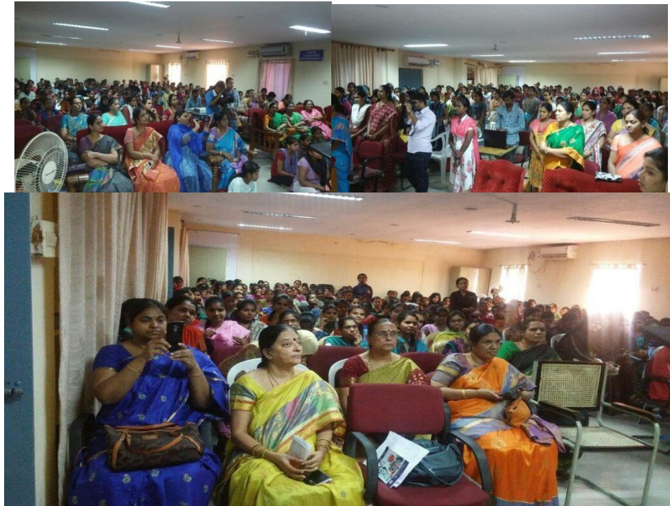
Staff and Students in the Valedictory Session