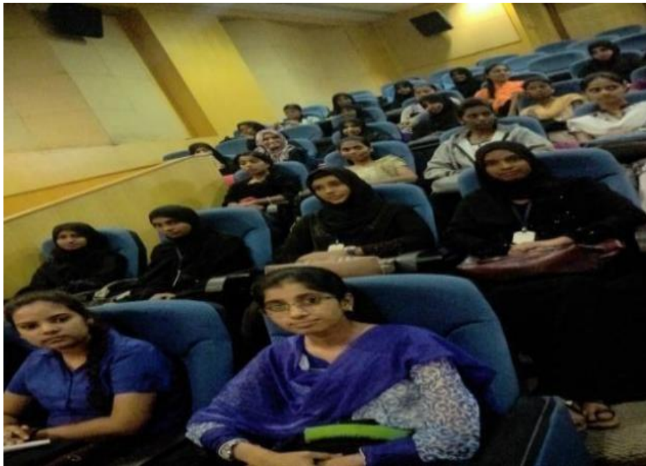
Students Participating in the programme