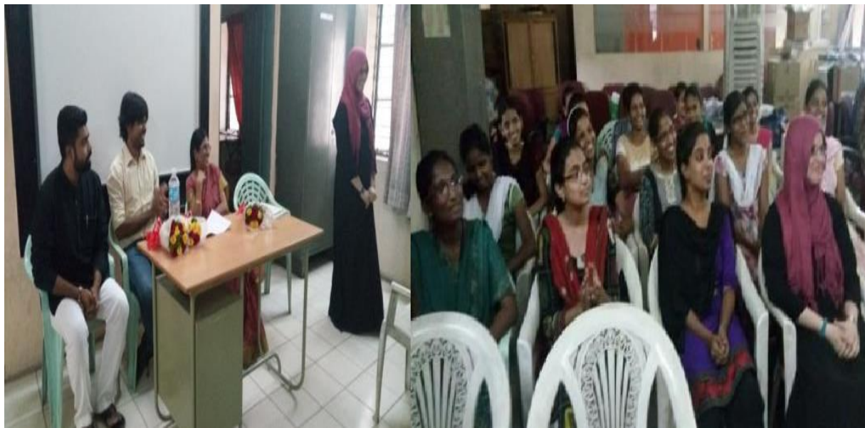
Inauguration of YuvaJagruthi