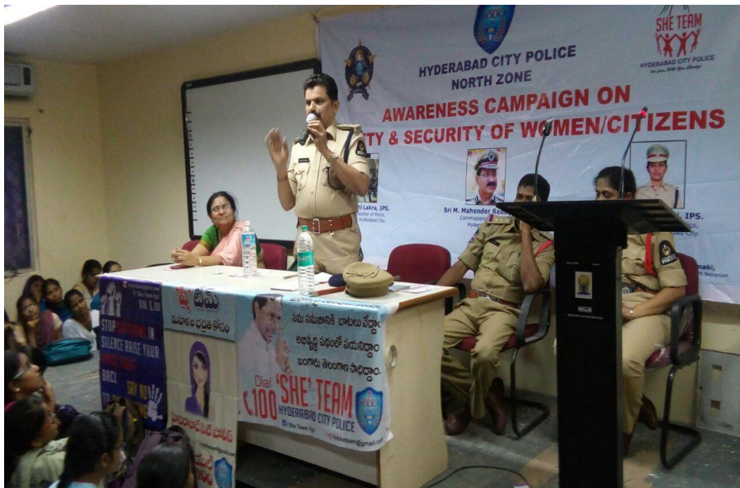
SHE Team Programme in the College

The majority of rapes occur in the victim's home. According to the Bureau of Justice, almost 40 percent of all rapes take place in the female victim's home. In the event that rape prevention fails—such as by avoiding problem areas or making sure a woman is never alone—the best chance for survival is to fight back. Fighting back is not just necessary, but it is a moral right because protecting one's self is paramount. The rest of the article will discuss why self-defense is important, some tools and techniques for effective self-defense, and information on gun use.