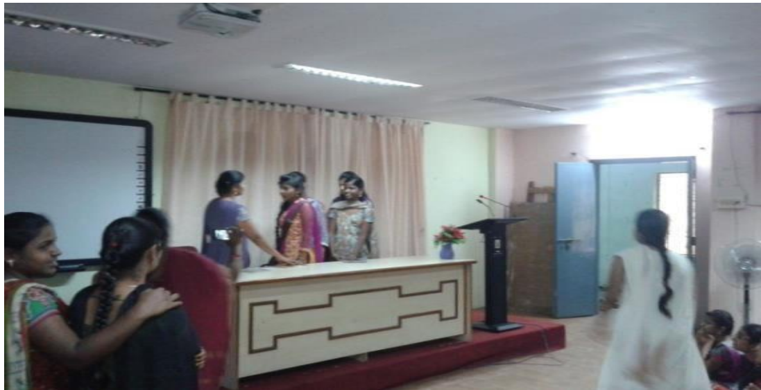
The senior students enacted a beautiful skit showing the traumatic effects of ragging.