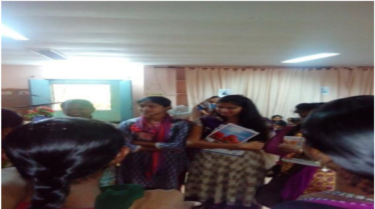
The senior students enacted a beautiful skit showing the traumatic effect of ragging.