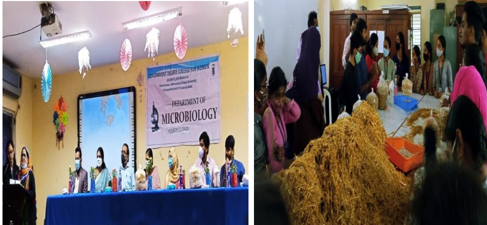
Students participating in Mushroom cultivation