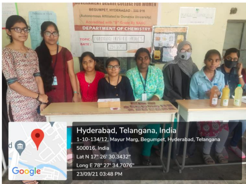
KumKum made by final year MbC students