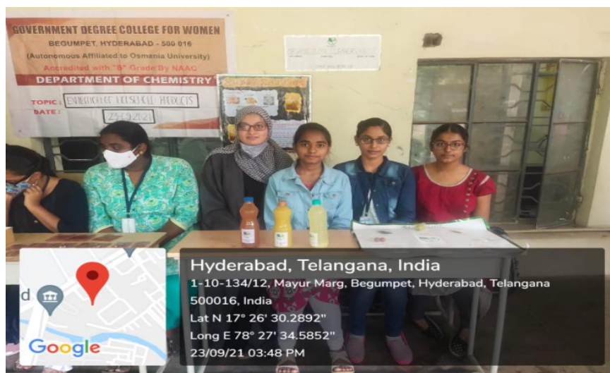
Flour cleaner made by final year MZC students