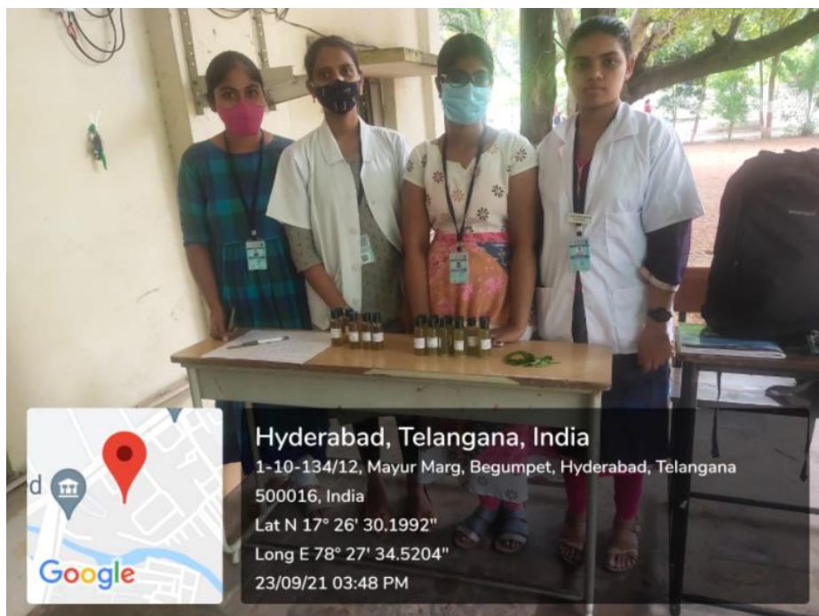
Herbal Oil made by final year MBC students