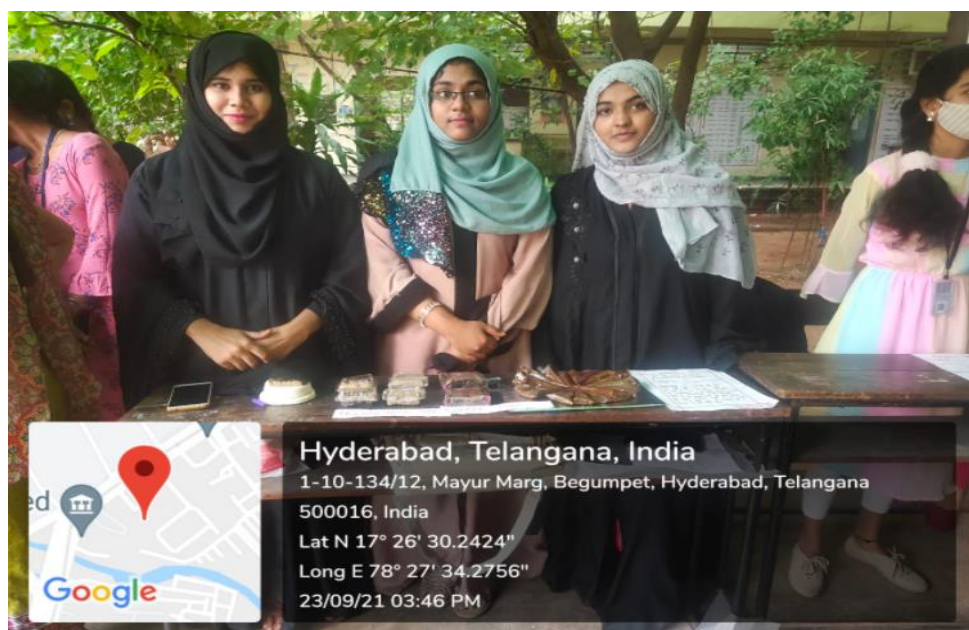
Mehendi and multanimitti soap made by AnBC and MBC final year students