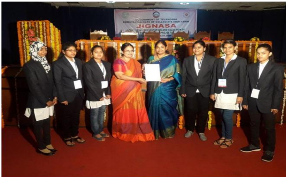
STATE LEVEL JIGNASA COMPETITIONS – STUDENTS AND MENTOR RECEIVING PARTICIPATION CERTIFICATES

Our students have worked on study project “Isolation of bacteria from biometric machines”. They were winners at cluster level and went to state level competitions in 2017.