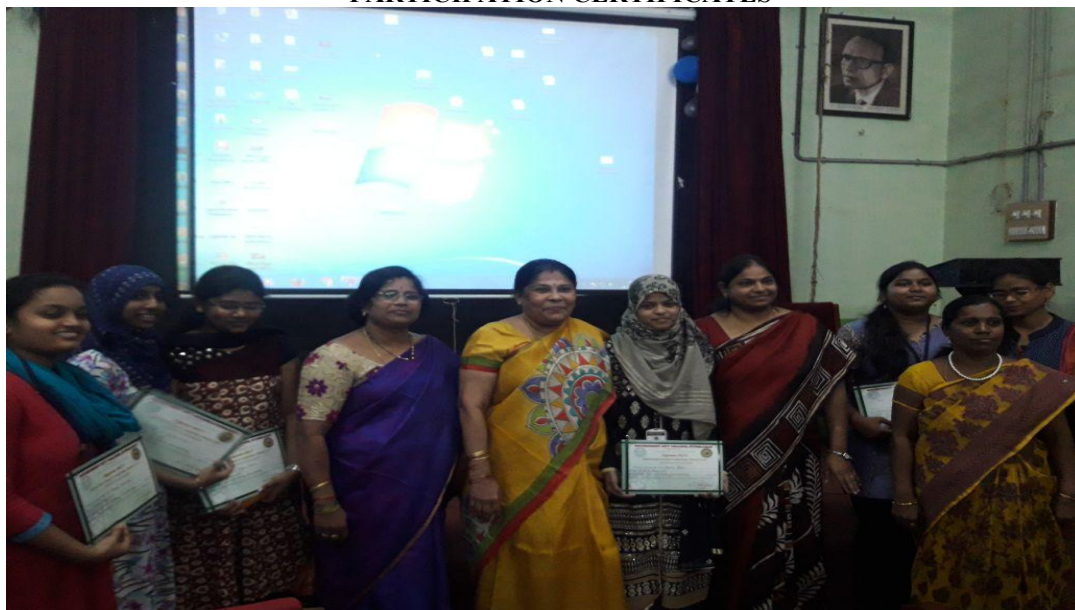
Cluster Level Winners in JIGNASA (CITY COLLEGE)