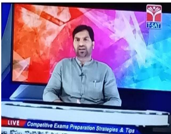
Students watching Live Class on TIPS FOR COMPETITIVE EXAMINATION