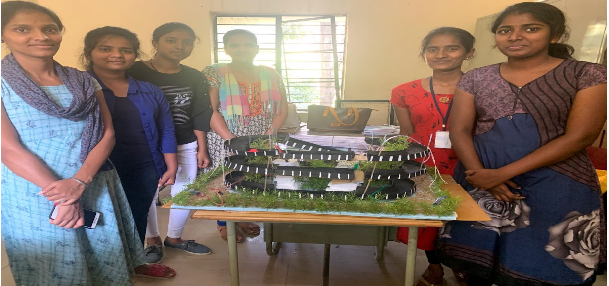
Students exhibiting their innovative model 2020