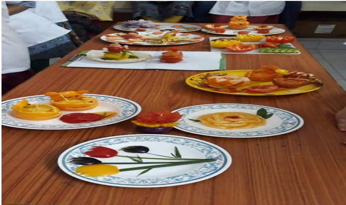
Vegetable and fruit crafting exhibition by B.Sc students