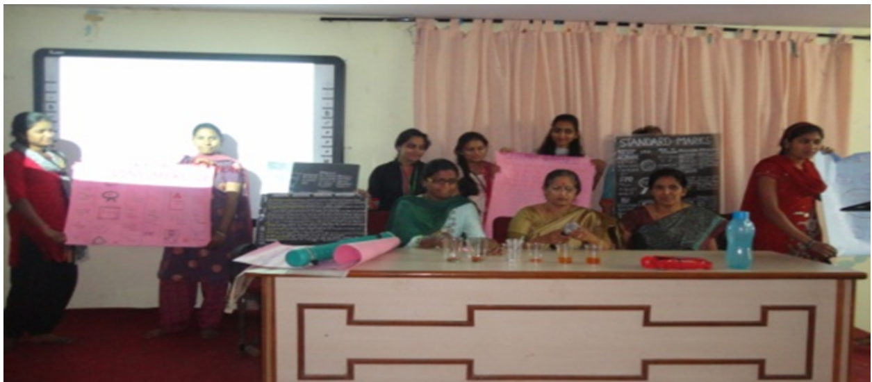
Involvement of students and teachers in demonstration (consumer club activities)