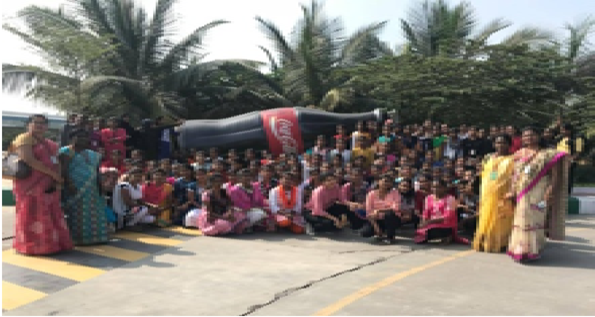
Field trip to COCO COLA Company