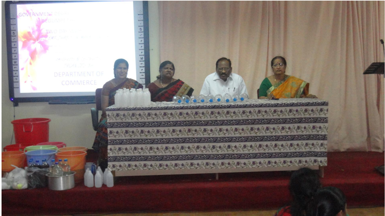
Two day workshop on self employable and marketing skills organised by dept of Commerce