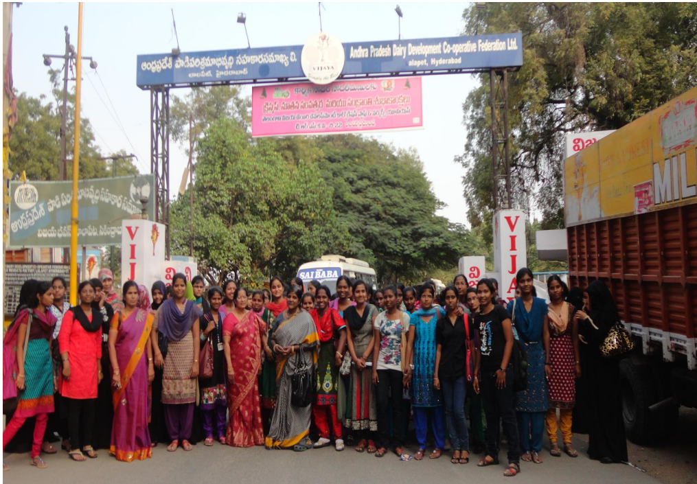
Commerce Dept: 2016 Field trip to AP Dairy development cooperative federation Ltd. Lalapet, Hyderabad