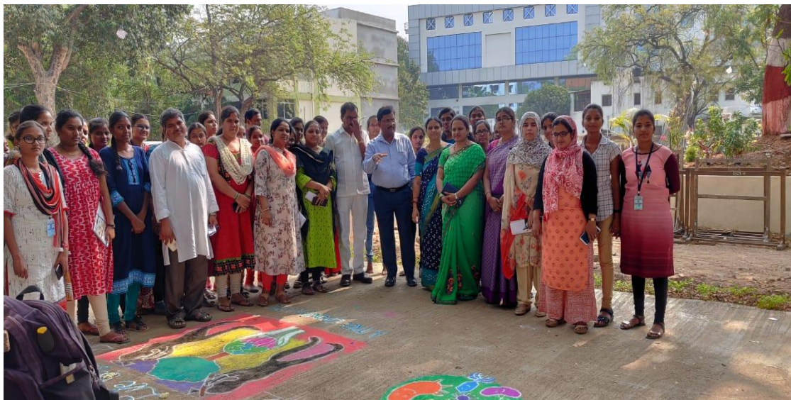
Rasayan and Micro rangoli by BSc students.