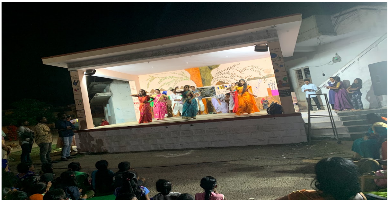
Community related activities -students participation in cultural activities creating awareness on social issues in the form of drama