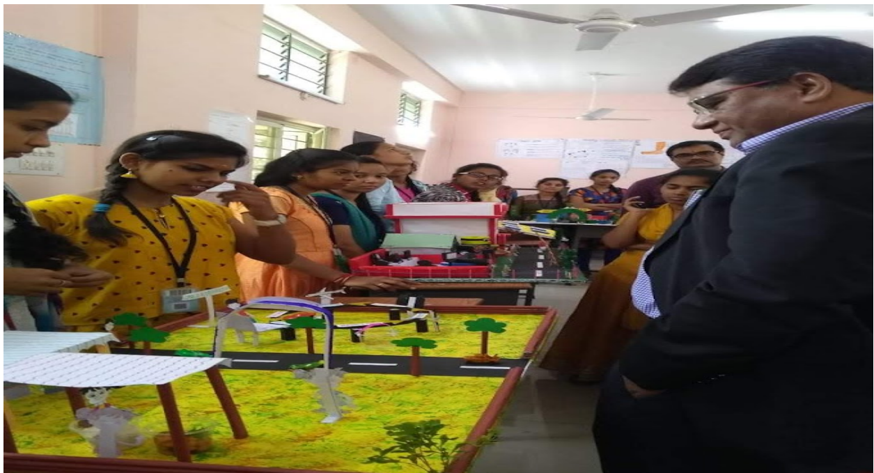
Students participation in Commerce exhibition 2018-19