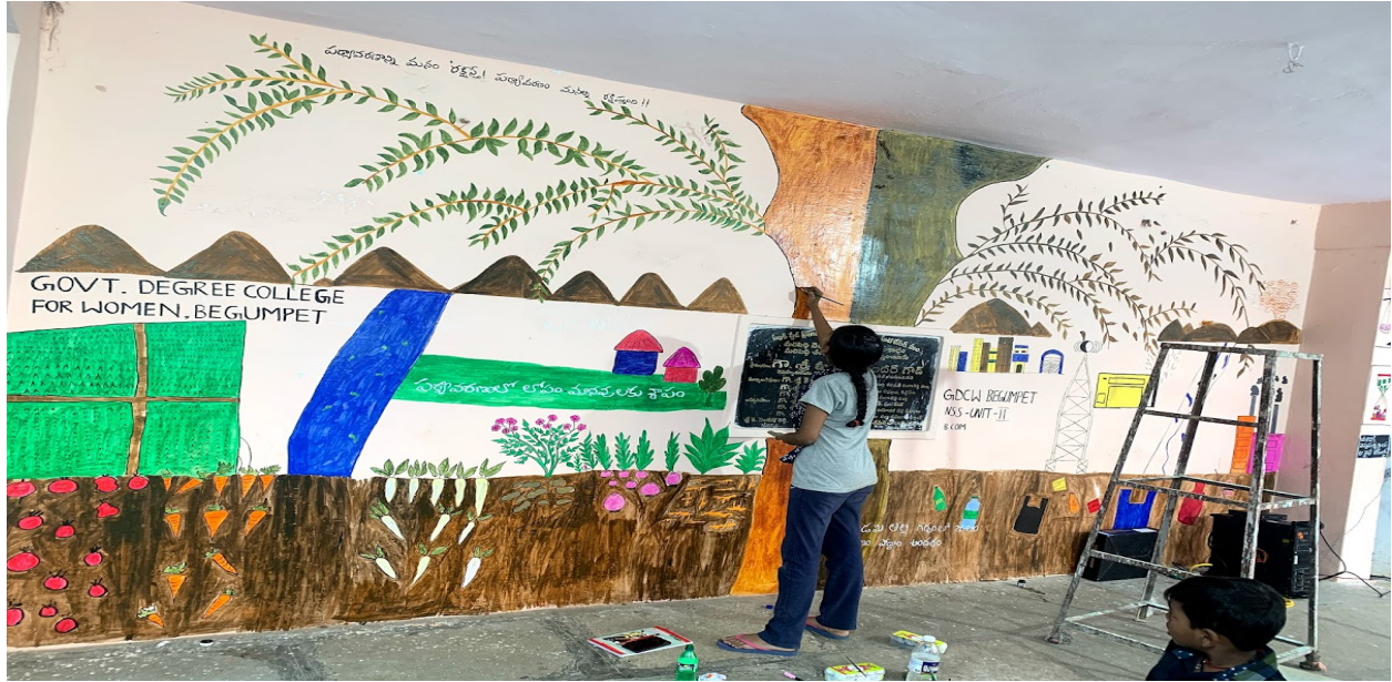
BCom Student exhibiting her talent in the form of wall painting at NSS camp.