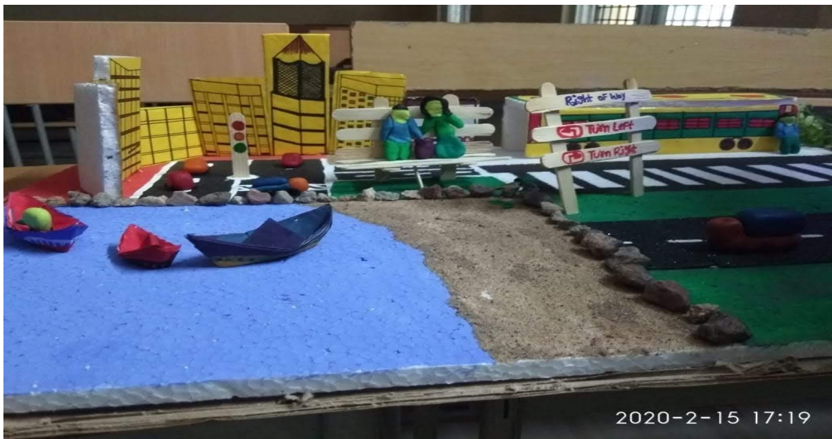
Encouragement of Students innovative and creative thinking - conceptual understanding in the form of models