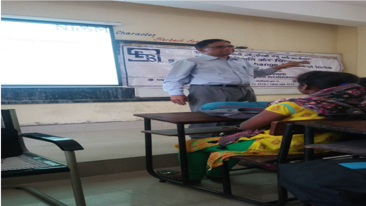
Extension lectures by experienced professor