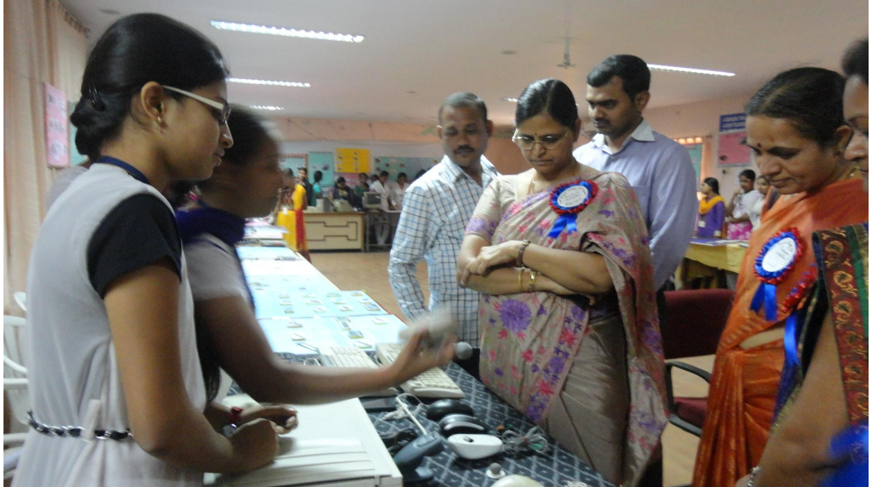
Computer dept exhibition 2016-17