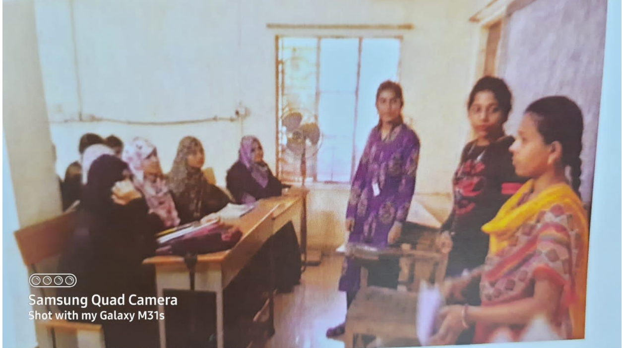
○○○○ Samsung Quad Camera Shot with my Galaxy M31s