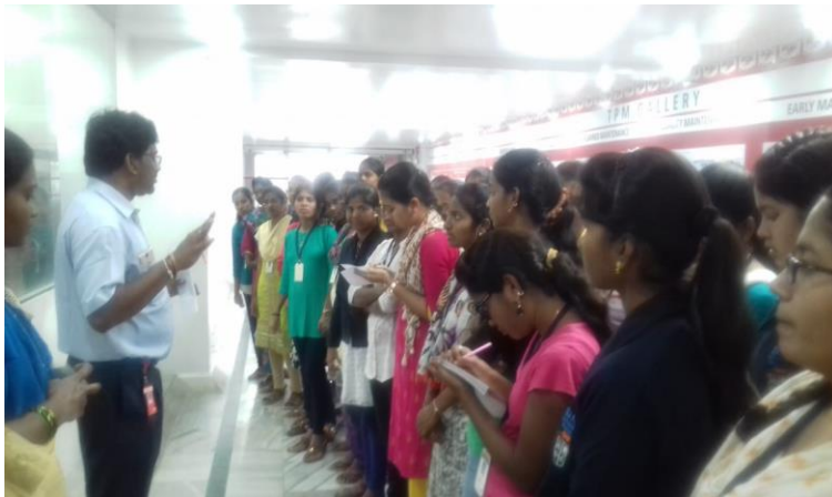
Topic: Field Trip to COCA COLA COMPANY