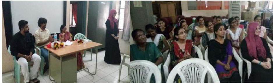
Inauguration of Yuva Jagruthi