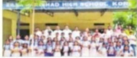
నోట్ పుస్తకాలు అందజేసిన దాతలతో జిల్లా కొర్రెముల్ పాఠశాల విద్యార్థులు