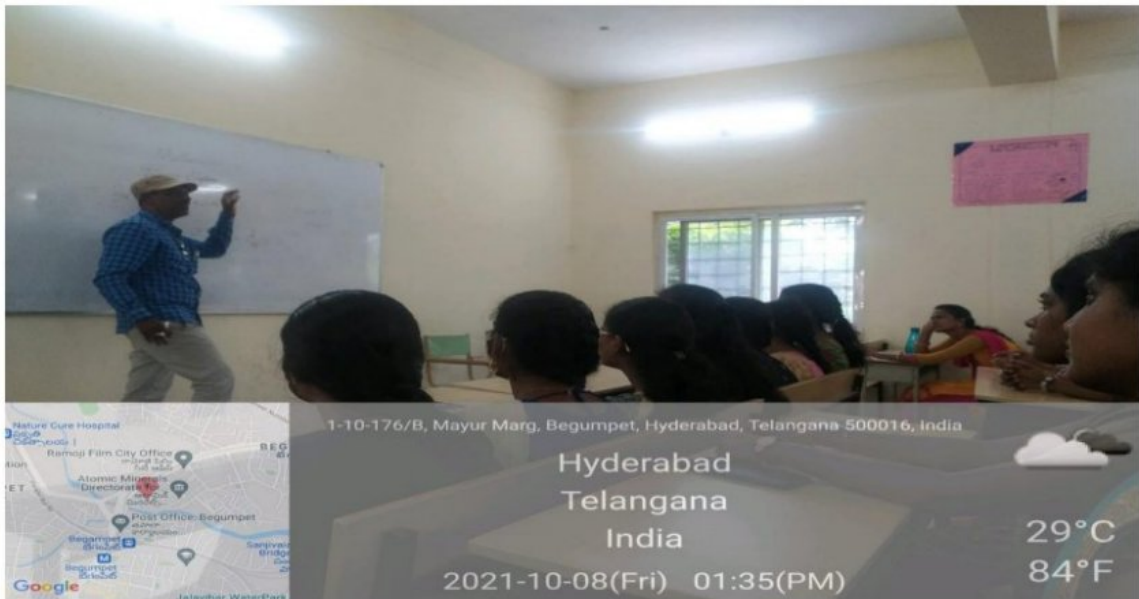
The students and faculty attending the induction program