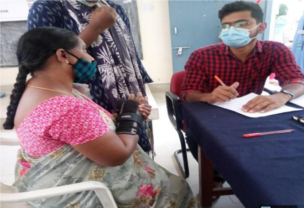
Blood Pressure and Sugar Test