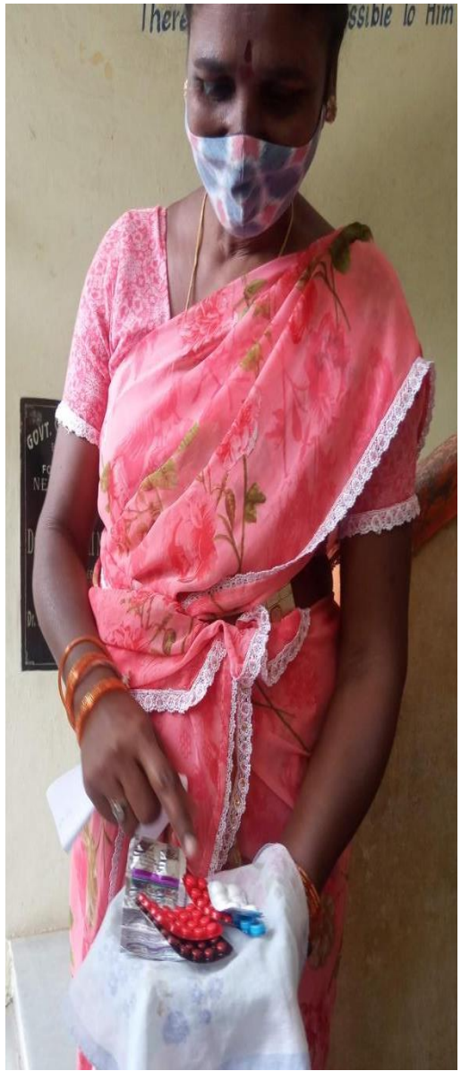
Medicines given to the non-teaching staff