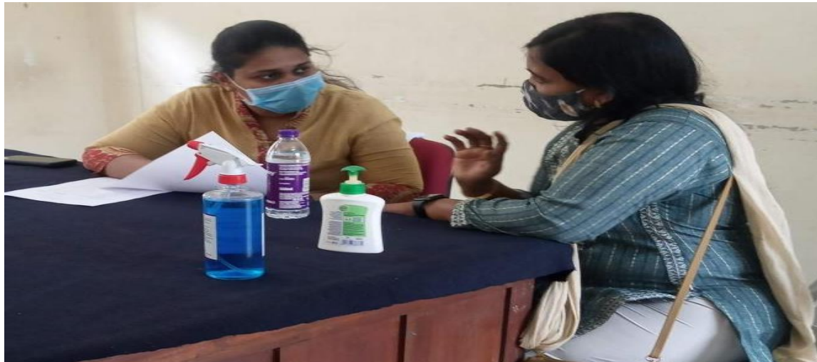
Orthopedics and Nutritionist consultations