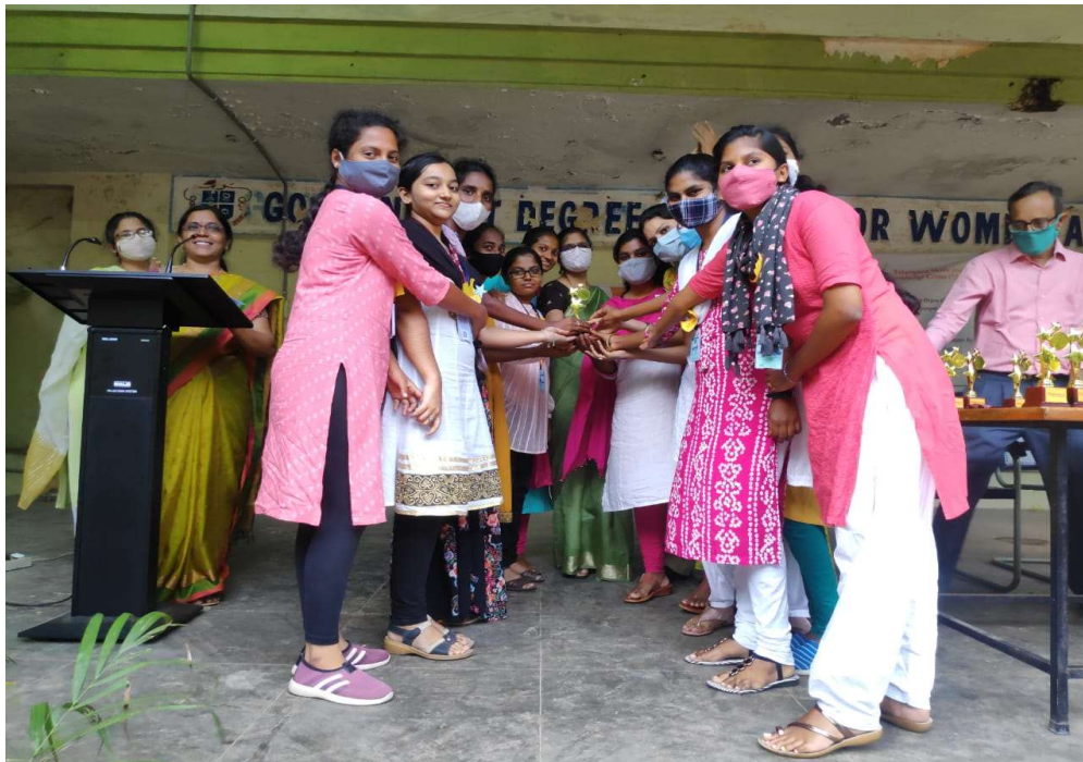
Fig 2. Prize distribution