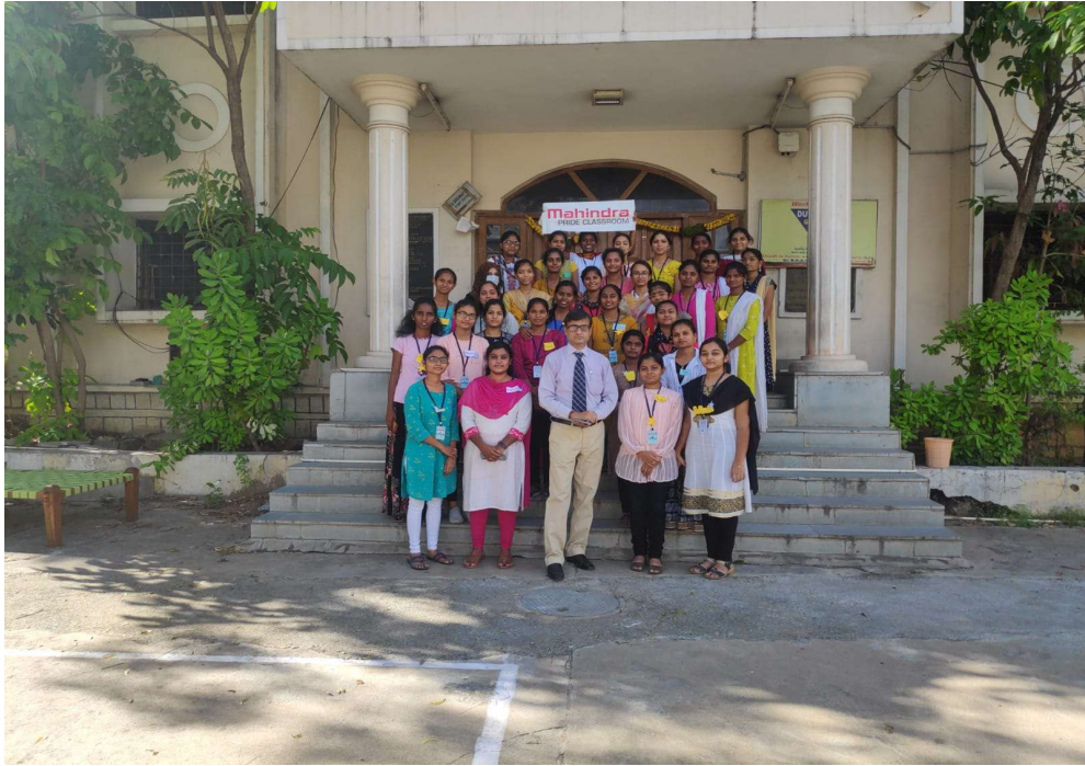
Fig 1. Group photo with trainer