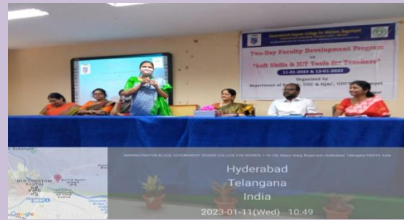
Lighting of the Lamp by the dignitaries