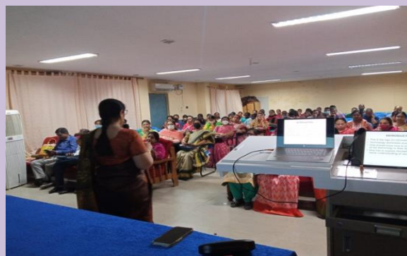
Session on ICT Learning Tools