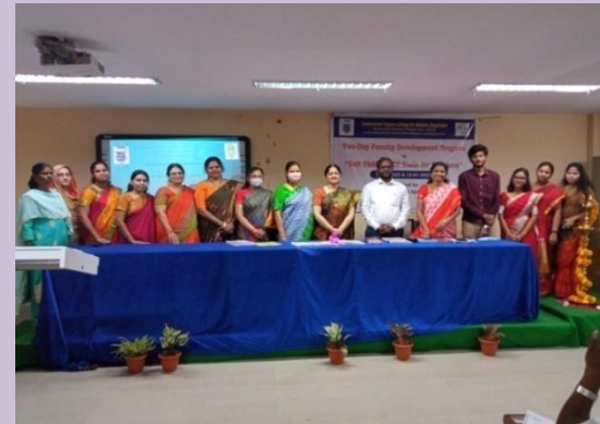
Inaugural Session & Release of UGC Journal Special Issue