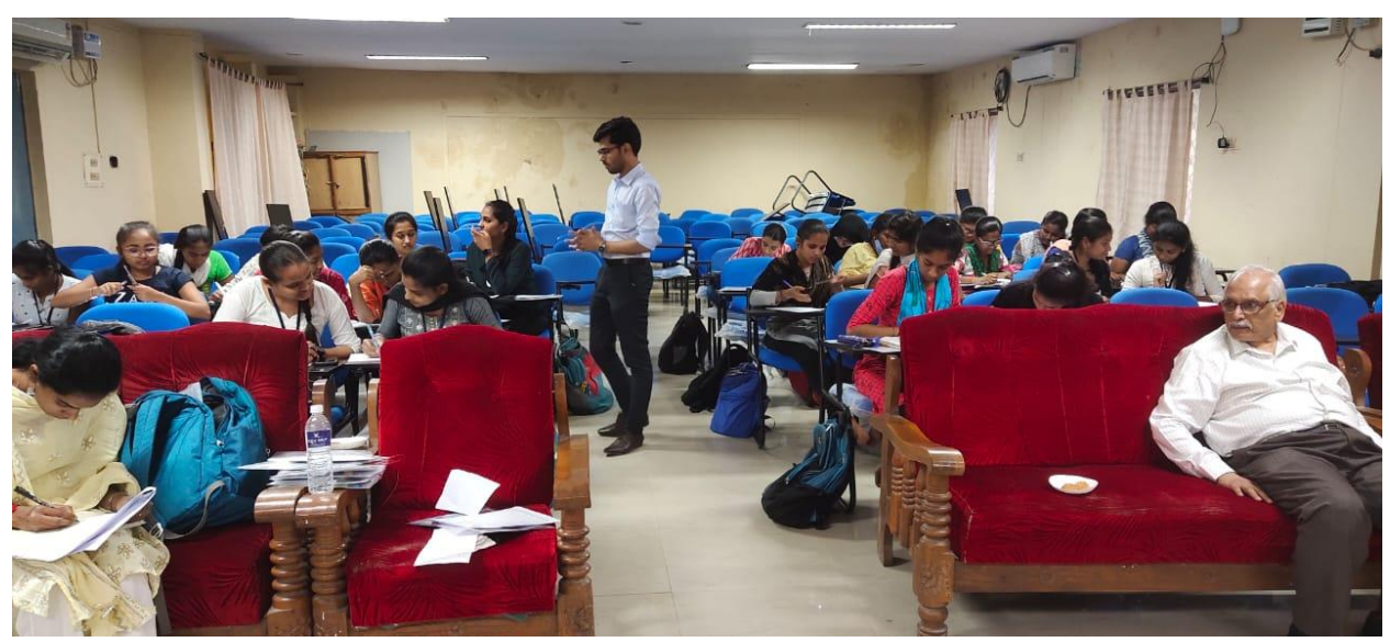
During standard writing competitions

During the competition, the students had the opportunity to choose between two topics to write, to which they chose to write on 'Pressure cooker'. After finishing the standard writing 4 winners were selected based on their all-round performance and certificate were given to all participants.