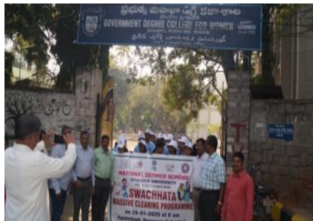
on 28 th January 2020.