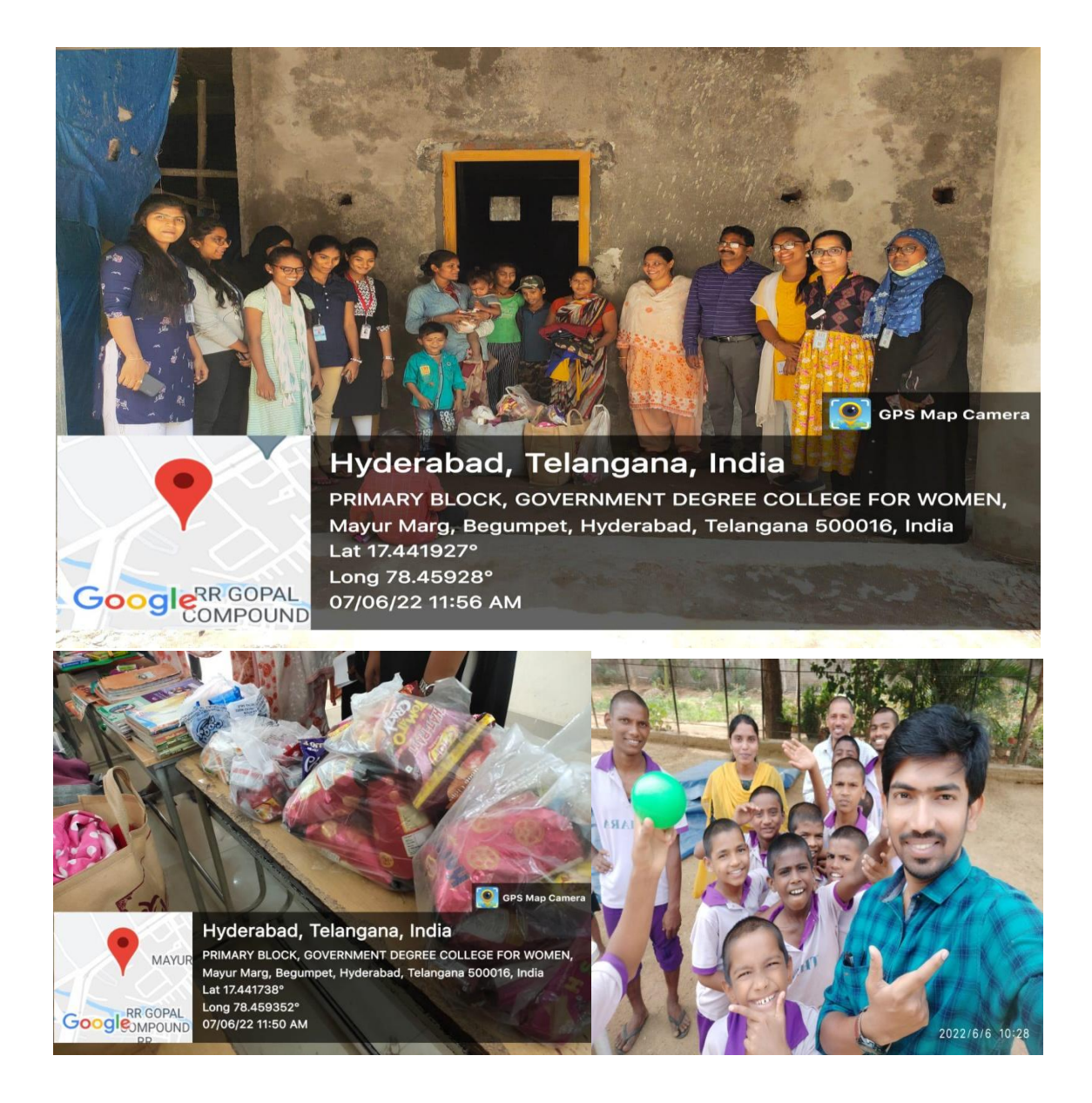
BOOKS AND CLOTHS DISTRIBUTION TO THE WORKING LABOUR CHILDREN CONSTRUCTING WASHROOMS @ BEGUMPET COLLEGE CAMPUS