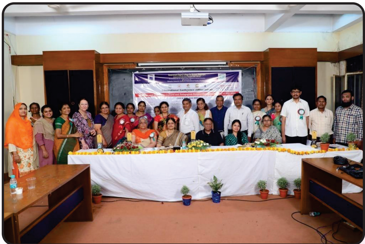
GDCW, Begumpet Faculty with the Dignitaries