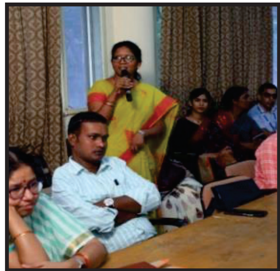
Participants Feedback about the Conference