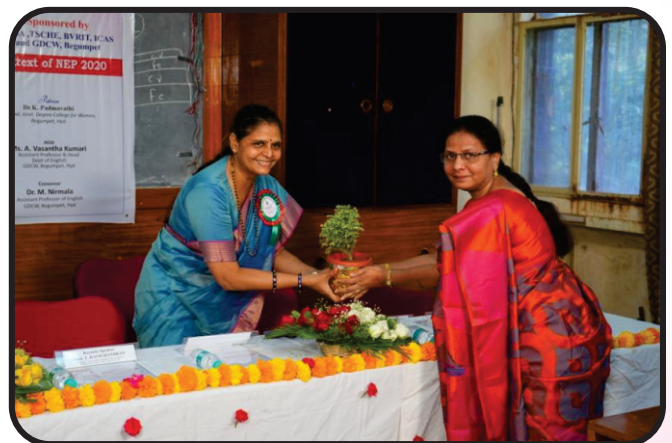
Head, Dept. of English Welcomes the Principal, GDCW Begumpet