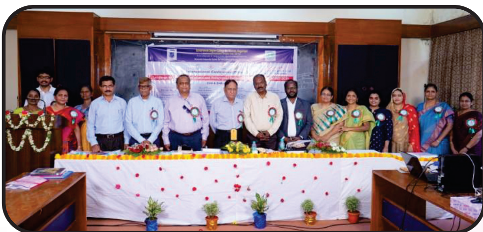
Department of English Faculty at the Inaugural Session