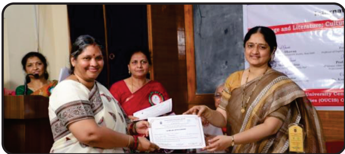
Certificate Presentation by the Chief Guest