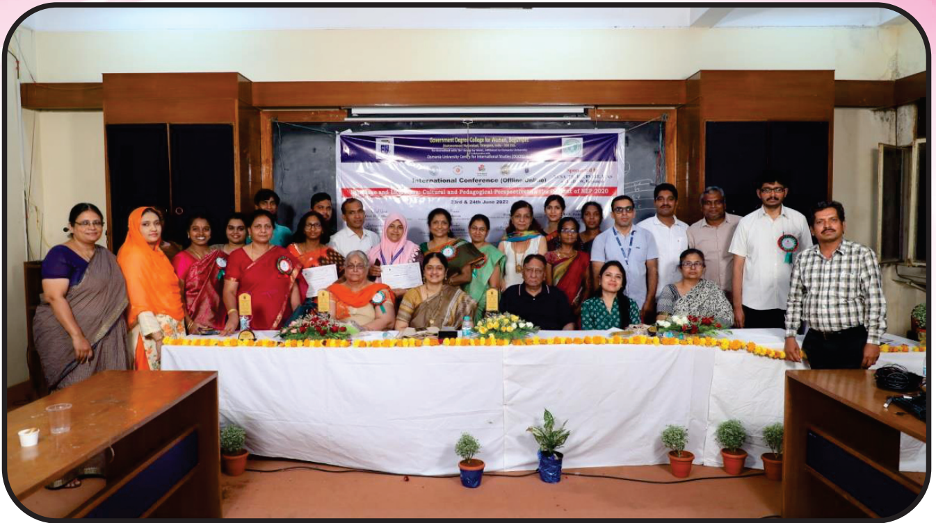
Delegates with the Dignitaries in the Valedictory Session