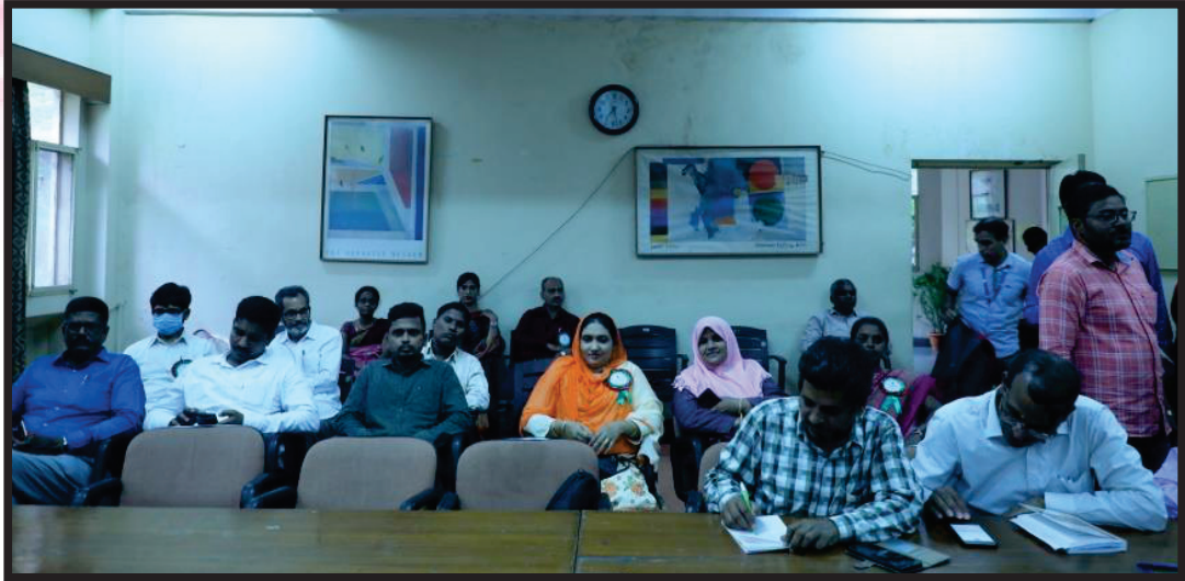
Participants attending the Plenary session