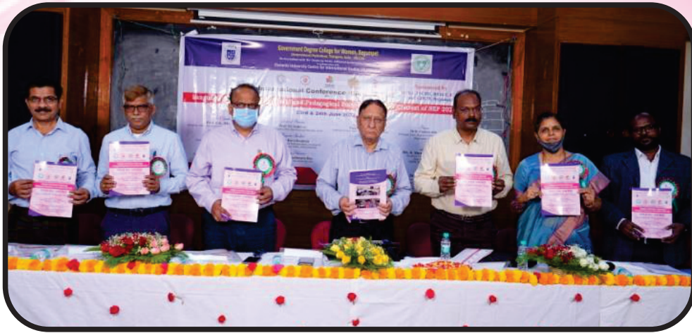
Souvenir Release by the Dignitaries