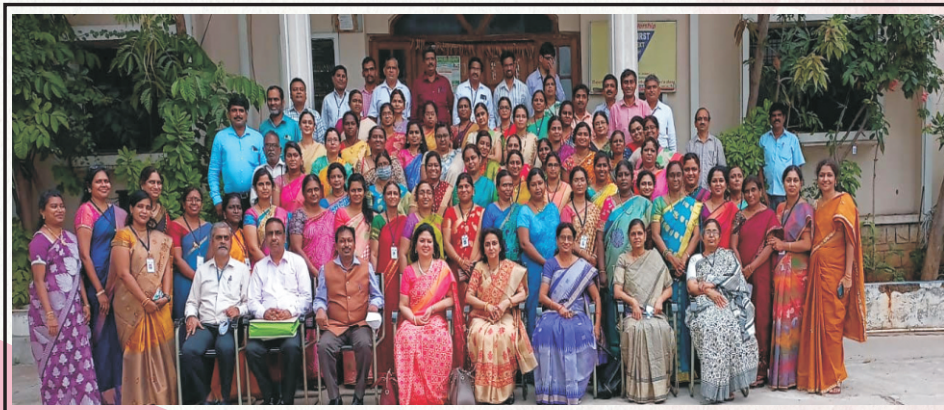
Teaching & Non-Teaching Staff of GDCW Begumpet with UGC / Autonomy Expert Committee, Sept-2021