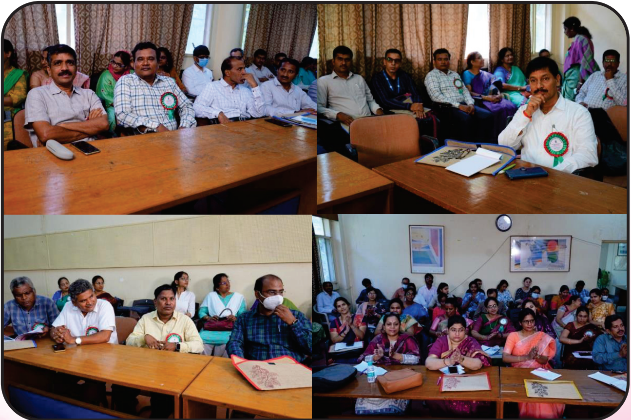
Delegates Participation in the Conference