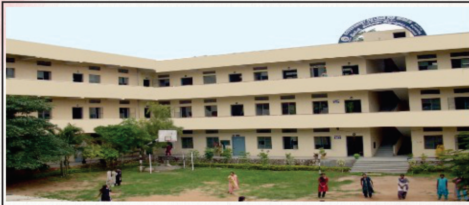
Government Degree College for Women Begumpet, Hyderabad