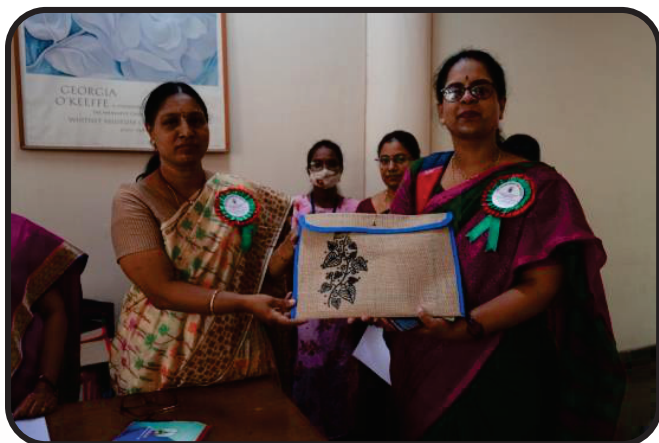
Distribution of Conference Kits to the Participants