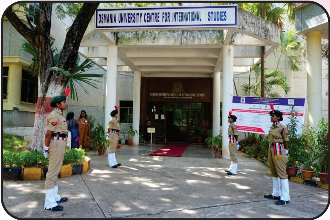
Venue: Osmania University Centre for International Studies