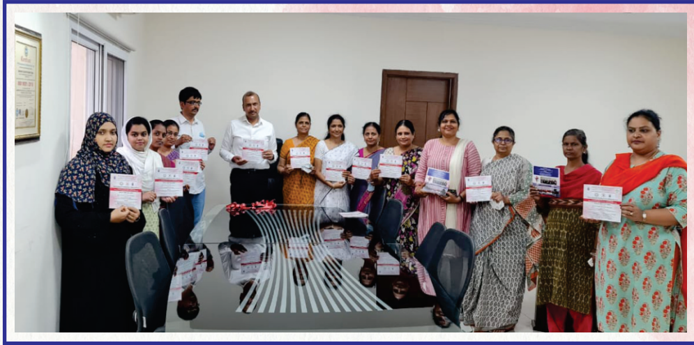
Brochure Release by Shri Navin Mittal, IAS, Commissioner of Collegiate & Technical Education, Government of Telangana