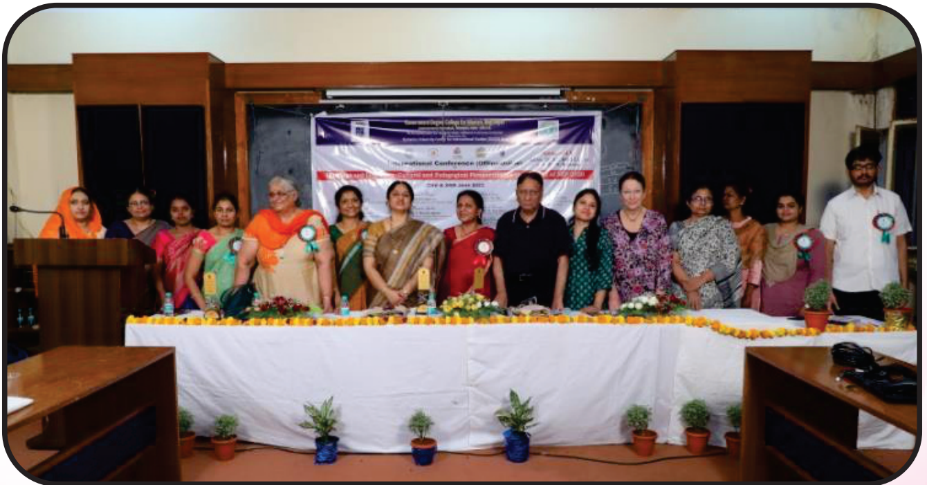
English Department Faculty with the Dignitaries in the Valedictory Session