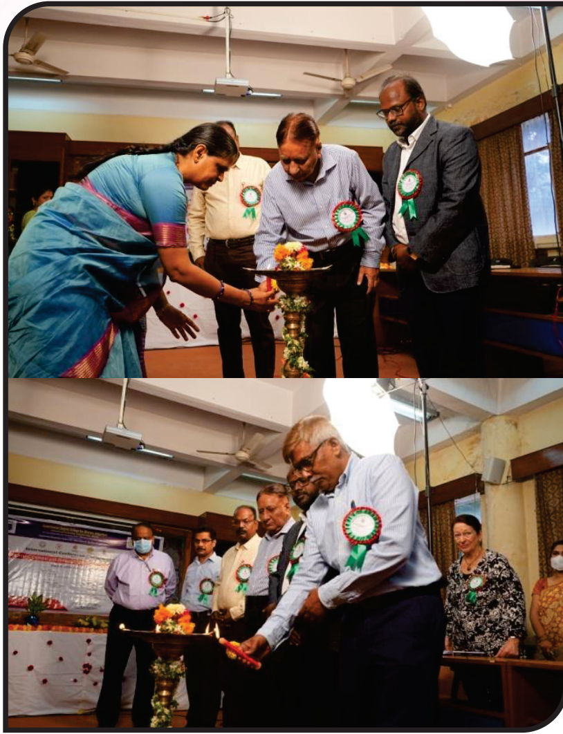
Lighting of the Lamp by the Dignitaries