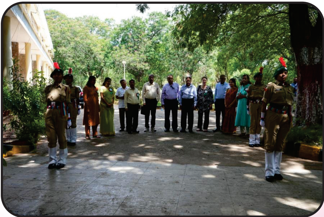
Guard of Honor Welcome by NCC Cadets