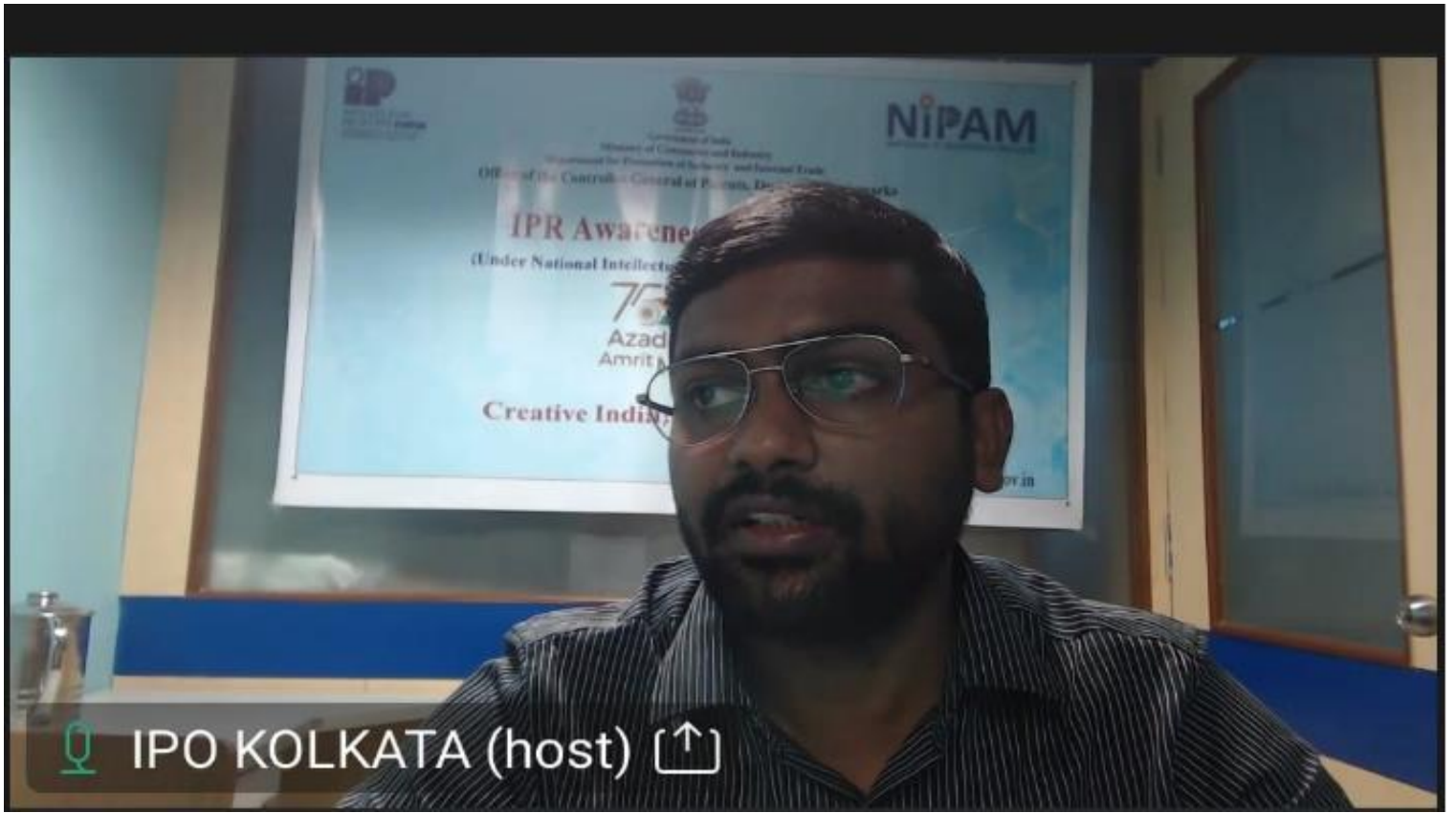
IPO KOLKATA (host) [↑]